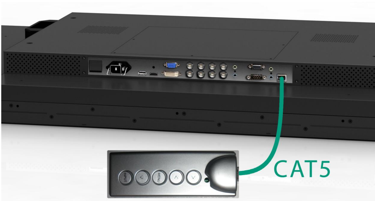
Serial Control Box to Screen Connection

Before using the Remote Control the Serial Control Box (with the remote's infrared sensor in it) must be connected to all of the screens.